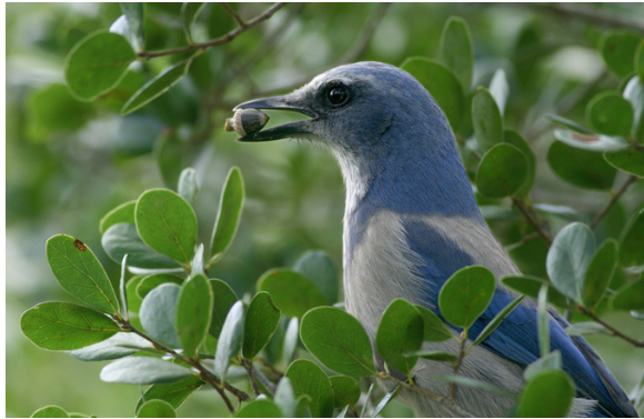
Figure 12.2. Florida scrub jay.

mice, sea turtles, beach nesting birds, and many endemic plant species. Many of Florida's rarest and most diverse communities occur as small isolated areas, such as pine rocklands, rockland hammocks, upland glades, seepage slopes, cutthroat seeps and springs (Knight et al. 2011). Florida has an extremely diverse estuarine and marine ecosystem; it is the only state in the continental U.S. with an extensive shallow reef system. The mild tropical-maritime climate of the Florida Keys provides habitats for a number of terrestrial and marine plant and animal species found nowhere else. The Florida Everglades has received international recognition and has long been recognized as one of our nation's most imperiled landscapes, included as one of 44 sites globally and one of two sites in the United States on the UNESCO List of World Heritage in Danger (Mitchell and Krueger 2011, Aumen et al. 2015). The Everglades is home to 68 threatened and endangered species (USFWS 1999). The Lake Okeechobee ecosystem is unique