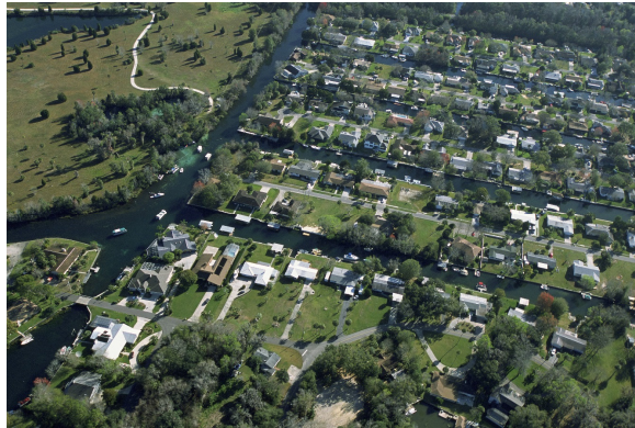
Figure 12.8. Habitat fragmentation.

al. 2013). Habitat loss has been identified as the most significant challenge Florida's biodiversity has faced over the past century (Knight et al. 2011). These threats are expected to continue as human populations are predicted to continue to increase and lead to additional land use changes. Fragmented habitats and human land uses will hinder movement of species, further reducing their ability to shift their distributions in response to climate change (Lawler et al. 2009;