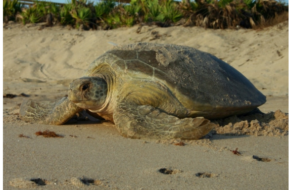
Figure 12.7. Green Sea Turtle.

Although sea turtles have been in existence for millions of years and have adapted to past changes in climate, it is still unsure whether they will be able to adapt to present day climate change; it is occurring more rapidly than has been observed in the past and it is accompanied by a variety of anthropogenic threats (Poloczanska et al. 2009; Fuentes et al. 2013). The cumulative impact of the various non-climatic threats sea turtles face makes their populations more vulnerable to climate threats and decreases their resilience (Fuentes et al.