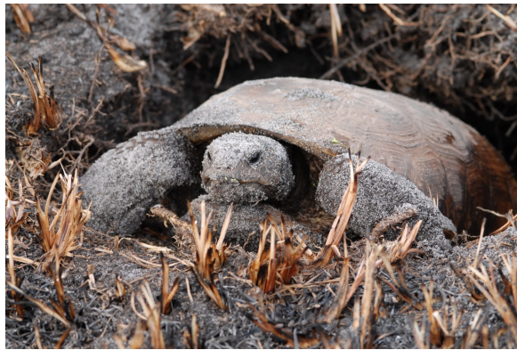
Figure 12.6. Gopher tortoise.

A keystone species is a species that has a significant effect on its environment relative to its abundance and plays a critical role in maintaining the structure of an ecological community, affecting a suite of other species in an ecosystem. Examples of keystone species in Florida include the gopher tortoise, reef building species and the American alligator ( Alligator mississippiensis ). The gopher tortoise is considered a keystone species for the sandhill