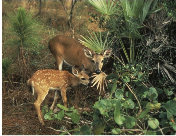
Figure 12.4. Florida Key Deer.

well as loss of crucial coastal habitat for species such as diamondback terrapin ( Malaclemys terrapin rhizophorarum ), which requires both marsh and beach habitats (Shellenbarger Jones et al. 2009). Inundation of coastal habitats will increase fragmentation as patches are divided by areas of open sea water. Sea level rise threatens small and low-lying islands with erosion or inundation (Baker et al. 2006; Church et al. 2006), many of which support high concentrations of rare, threatened, and endemic species (Baker et al. 2006). Of