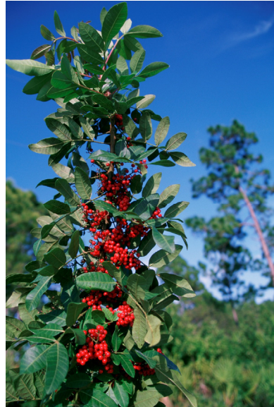
Figure 12.9. Brazilian pepper.

Invasions of new species are assisted by land use changes, the alteration of nutrient cycles, and climate change (Vitousek et al. 1996; Dukes and Mooney 1999; Mooney and Hobbs 2000; Hellman et al. 2008). Climate changes, including extreme climatic events (i.e., storms, floods), can enhance invasion processes from initial introduction through establishment and spread (Dukes and Mooney 1999; Walther et al. 2009; Diez et al. 2012). Human-aided transport of invasive species occurs through purposeful introductions for a variety of reasons (e.g., biocontrol, sport fishing, horticulture, agriculture, aquaculture) and through accidental introductions during the course of other economic activities. Climate change could alter these patterns of human transport (Hellman et al. 2008). Changes in the amount and timing of precipitation can alter the pathways of species introductions as new or increased flow routes transport invasive species, including animals, plants and plant propagules. Changes in precipitation may also allow for additional areas to be invaded by existing species, such as the Brazilian pepper ( Schinus terebinthifolius ), where it is restricted by inundation periods longer than three to six months (Ferriter 1997).