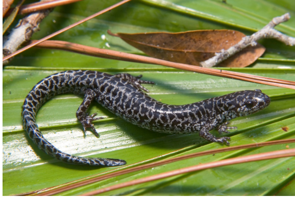
Figure 12.5. Flatwoods salamander.

Herbaceous wetlands provide the foraging and nesting habitat for many species, including waterfowl, Florida sandhill crane ( Grus canadensis pratensis ), snail kite ( Rostrhamus sociabilis plumbeus ), limpkin ( Aramus guarauna ), mink ( Mustella vison ), river otter ( Lutra Canadensis lataxina ), Florida gopher frog ( Rana capito ), tiger salamander ( Ambystoma tigrinum ), and flatwoods salamanders ( Ambystoma cingulatum ). These wetland-dependent